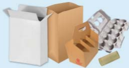
Boxboard (Dry-food boxes, paper bags, egg cartons, rolls)