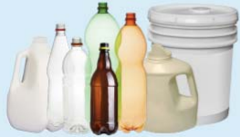
Plastic Containers (#1-#7, 5-gallon pails)