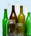
Glass Bottles (Food jars, beverage)